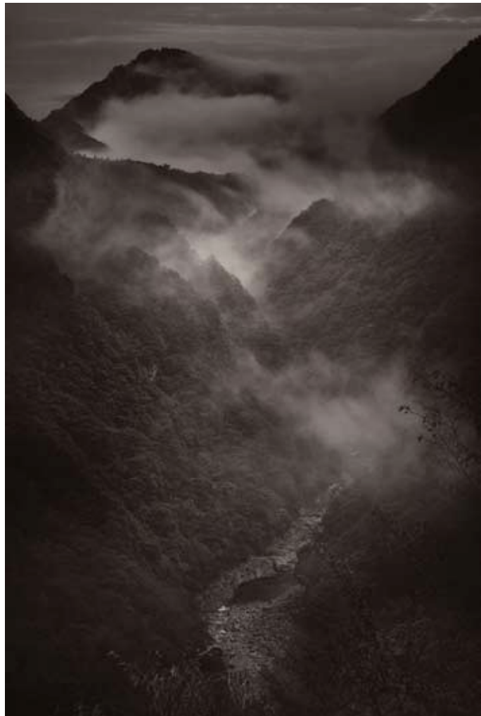
Iya Valley Sunrise

The day's activities include a cruise on a small river boat on the calm waters of Oboke Canyon and a visit to the Kazurabashi Bridge . In the afternoon, we will have free time to enjoy the unique baths at Iya Onsen and for photography.