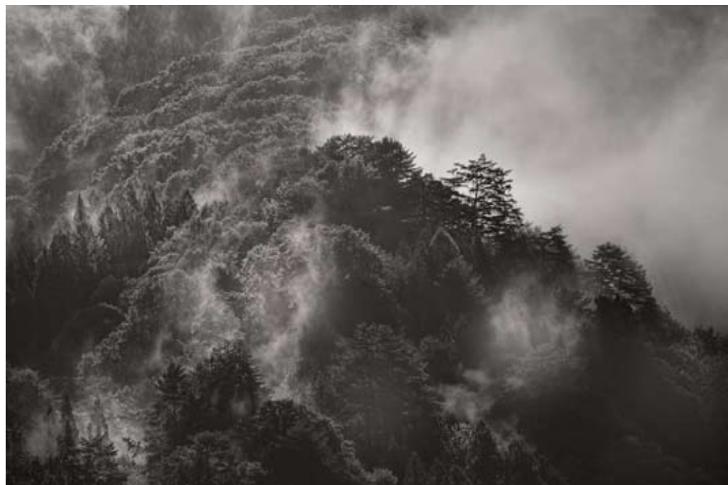
Fog in the Mountains

Following a picnic box lunch, we will visit Nagaro Scarecrow Village . As the population of Nagaro declined, one elderly resident began to create Kakashi (scarecrows) to replace people who had left or died. The Kakashi are often celebrated as they are said to bring back good memories to the local community.