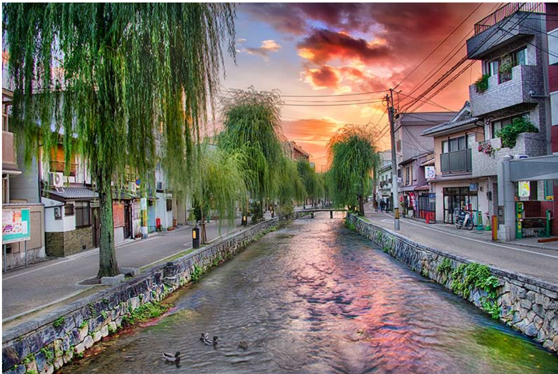
Shirakawa River, Kyoto

If bringing any appliances, please note that most North American appliances can be used in Japan. Please ensure your appliances have plugs with 2 flat prongs, or bring a 3-prong to 2-prong adapter. Outlets in Japan do not accept 3-prong-grounded plug types. Some lodgings may only have a limited number of outlets in the room, so if you are charging more than one item of equipment, you may wish to bring a small multi-socket adapter.