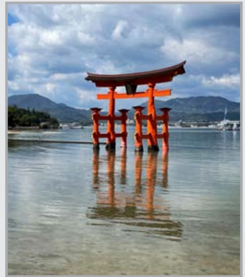
Floating O-Torii, Miyajima

Sunday, November 9, 2025 to Saturday, November 22, 2025