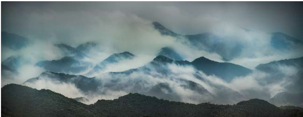
Pano Kumano Sanzen

Group Size: This is an exclusive, small photo workshop (non-photographer significant others are also welcome) with very limited space availability. The minimum group size is six and the maximum is twelve.