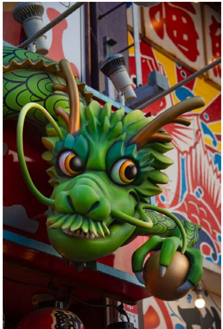
Green Dragon, Osaka