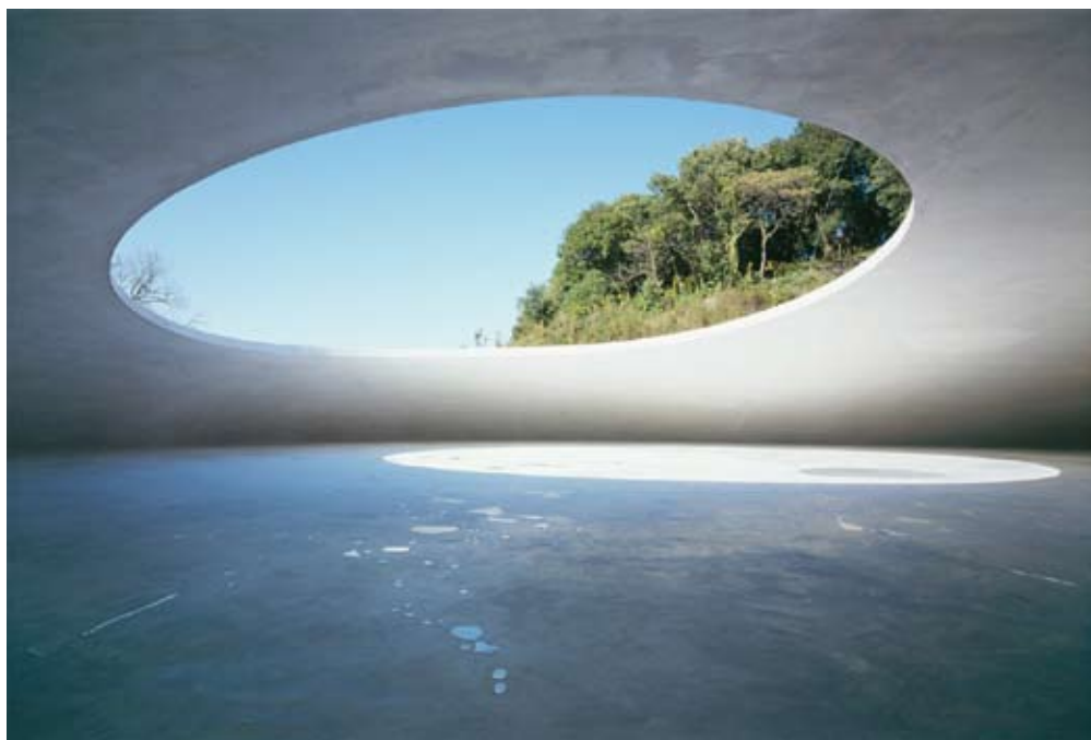
Benesse Art Site

We will take our time exploring what Teshima has to offer, as we travel by private vehicle, visiting three fishing villages along the way. At the end of the day, we will leave the island by ferry to travel to Kurashiki where we will spend three nights. This evening we will be reunited with our luggage.