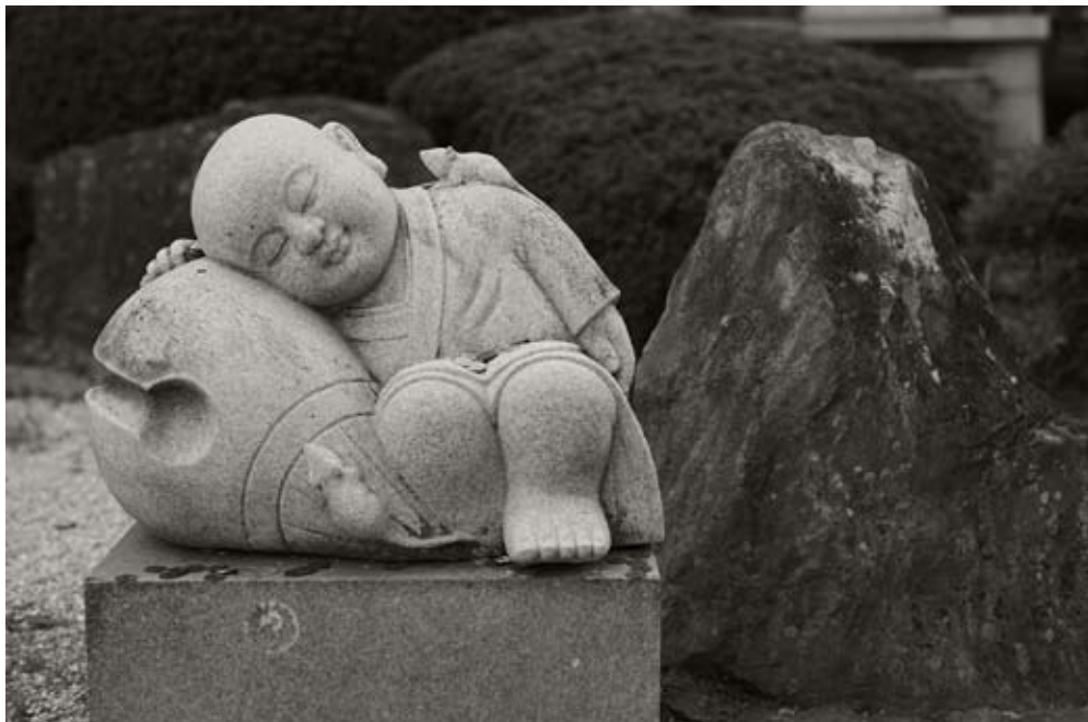
Photographed at a Shikoku Pilgrimage Temple

Today we will travel by private coach across the bridges to Shikoku Island, stopping along the way for an excursion to photograph the Naruto Whirlpools from a boat. This natural phenomenon is caused by tidal water travelling between the Seto Inland Sea and the Pacific Ocean. We will aim to time our journey with the tide to get the best chance to photograph the whirlpools in action. From Naruto, we continue our journey to Shikoku where we will visit a few of the 88 temples on the famous pilgrimage route . We will spend three nights at Iya Onsen, high in the interior mountains of Shikoku.