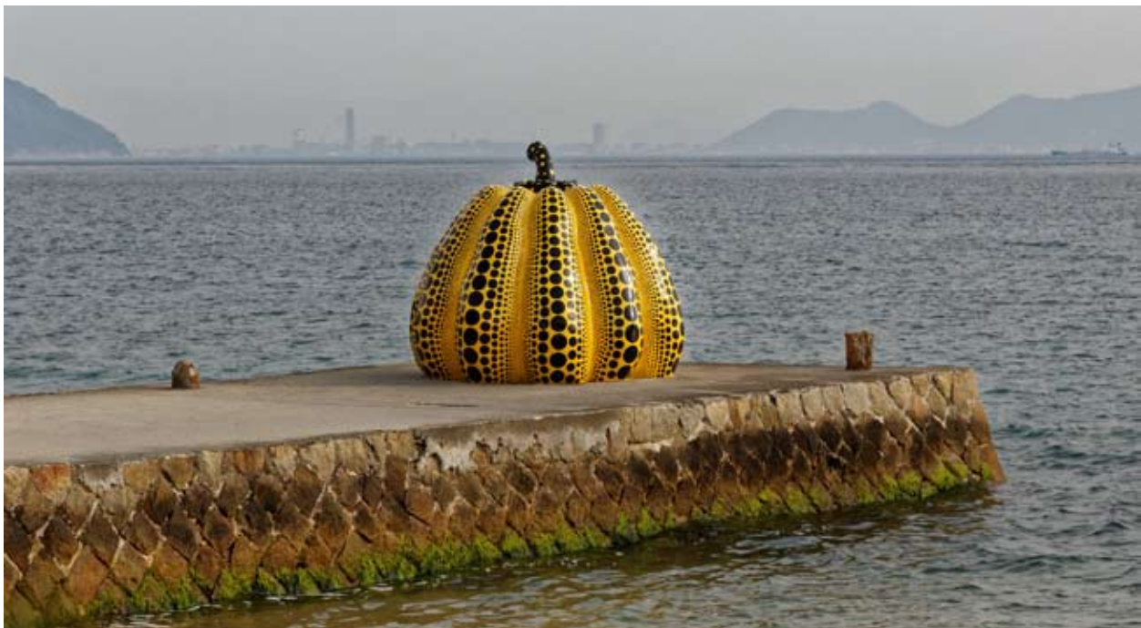
Yayoi Kusama - Pumpkin

Included in the cost is a visit to Benesse Art Site, and one other museum on the island.