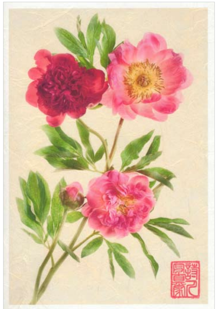
Peonies mon Amour © Harold Davis. Printed on Awagami Unryu washi.

Please Note: After breakfast, have your suitcases ready for transport to the hotel in Kurashiki. We will be without our suitcases overnight so that we can easily walk across Teshima Island without burdens. Do keep your photographic gear with you.